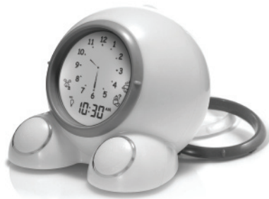
Teach Me Time! Talking Alarm Clock & Night-Light

Please visit us online at www.americaninnovative.com to view our full assortment including the award-winning Teach Me Time!